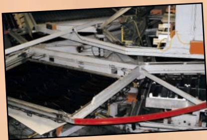
Multiple Station Forming Machines