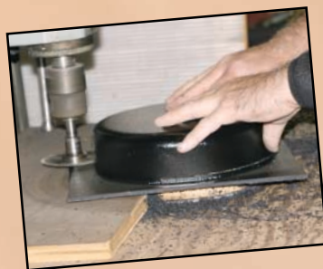
A Complete Line of Secondary Capabilities