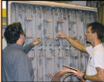
In-House Design, Molds and Tooling